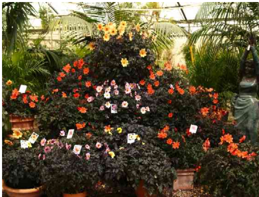
PlantHaven Pack Trials April 2007

Production time: 8-10 weeks from tissue culture to 5cm pot. 16-24 weeks from tissue culture to finished 1.5 litre pot. Can also be done vegetatively, easily.