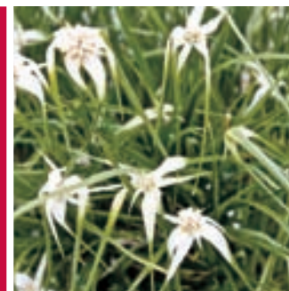
White Star Grass