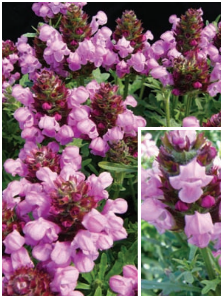
With its vibrant, large blooms, 'Summer Daze' is sure to inspire impulse sales.

Place the cuttings under a low misting regime for the first seven to 10 days of propagation. When