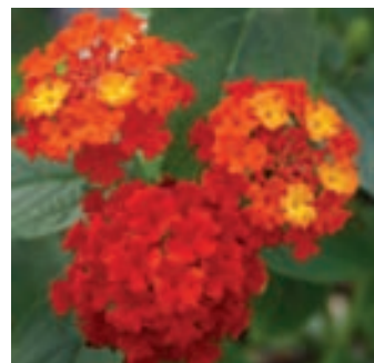
LUSCIOUS™ Citrus Blend™